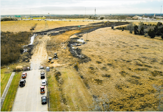
Airport Avenue is being extended from B.F. Terry Blvd. for Village Crossing, a new 108-acre mixed-use development. Cavender's Boot City is the first tenant of the project.