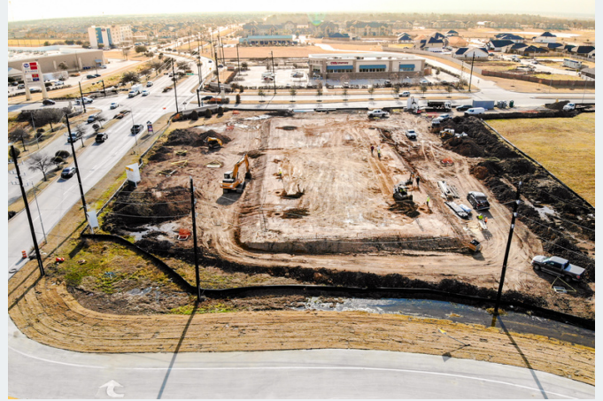
Construction is underway for The Shops at Summer Park - an 18,500 sq. ft. space for retail and dining located at the corner of Spacek and Reading Road.