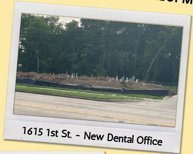
1615 1st St. - New Dental Office