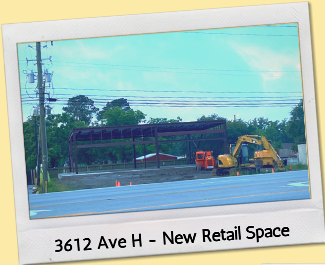
3612 Ave H - New Retail Space