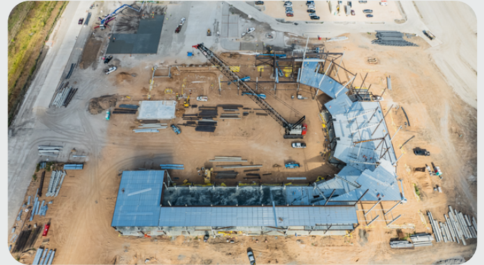
Fort Bend County EpiCenter Intersection of Hwys 36 & 59