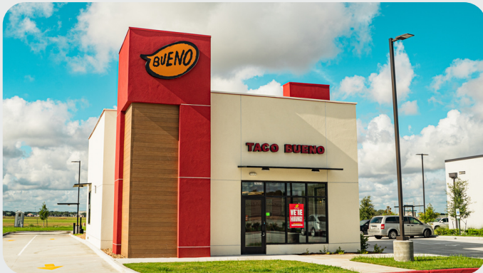
Taco Bueno 28225 Southwest Fwy