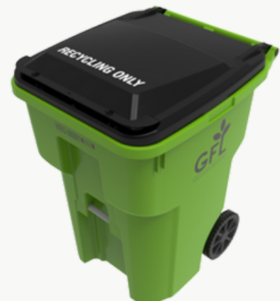
Green Poly Cart with black lid is for recycle only.