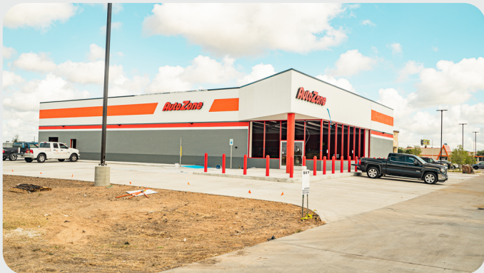
AutoZone Intersection of Hwys 36 & 59