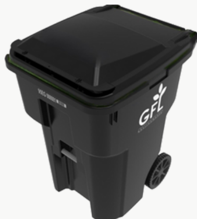
Black Poly Cart is for trash.