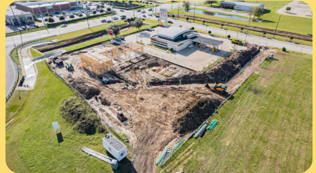
JIFFY LUBE 6521 Reading Road