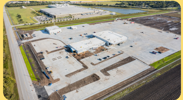
CENTERPOINT ENERGY SERVICE CENTER 935 Highway 90A