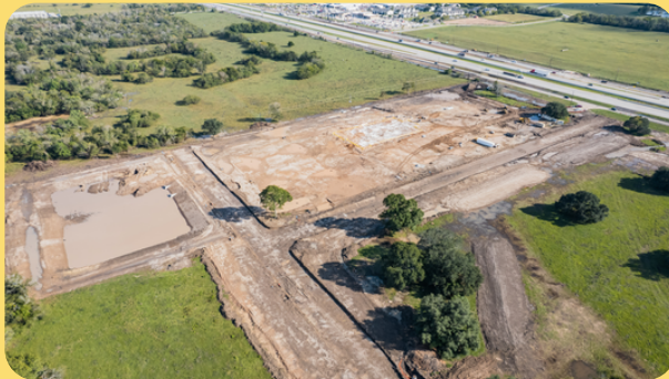
TEXAS DEPARTMENT OF PUBLIC SAFETY MEGA CENTER 27750 Southwest Freeway