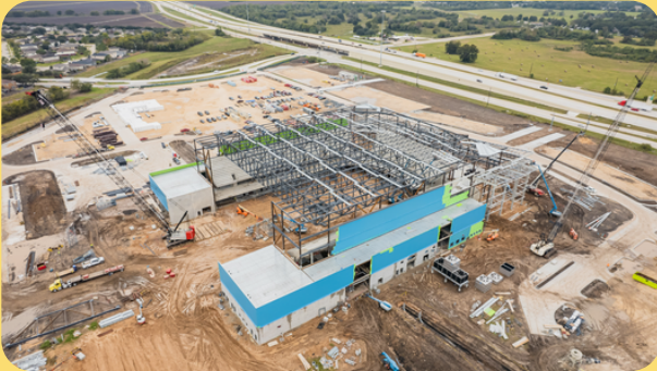
FORT BEND COUNTY EPICENTER 28505 Southwest Freeway