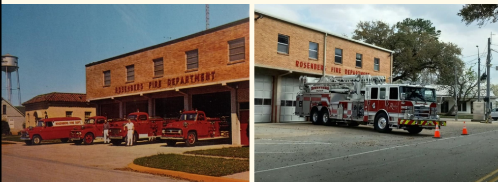
At left: Fire Station No. 1 in 1952. At right: Fire Station No. 1 today.

For more information about the Fire Department or Capital Improvement Projects, please visit the website or call Citizens Relations at 832-595-3301.