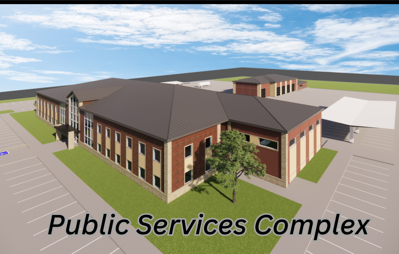
Public Services Complex

For more information regarding the bonds and charter amendments, please contact Citizens Relations at 832-595-3301 or email info@rosenbergtx.gov .