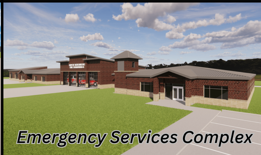
Emergency Services Complex