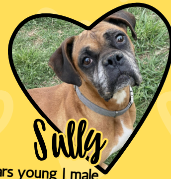
Sully 6-8 years young | male

Call the Rosenberg Animal Control and Shelter at 832-595-3490 or visit the website to learn more about how one of these sweet sugar faces can join your family!