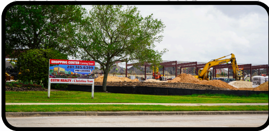
Retail Shopping Center 1821 B.F. Terry Blvd