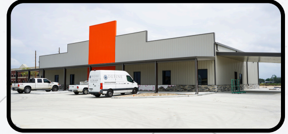
Lansdowne-Moody Kubota Dealership 25825 Southwest Fwy