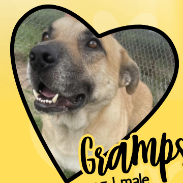
Gramps 10 years young | male