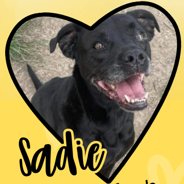
Sadie 8 years young | female

It's not the Class of 2024 graduating seniors, but our precious senior pups that need FUR-ever homes!