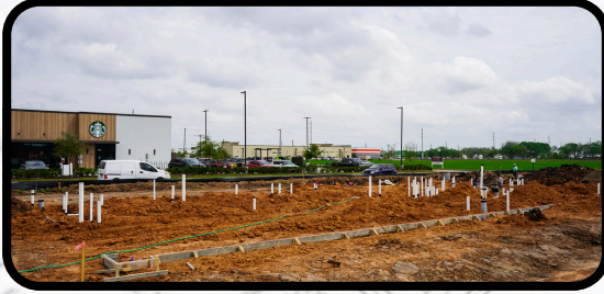
Panda Express 28307 Southwest Fwy