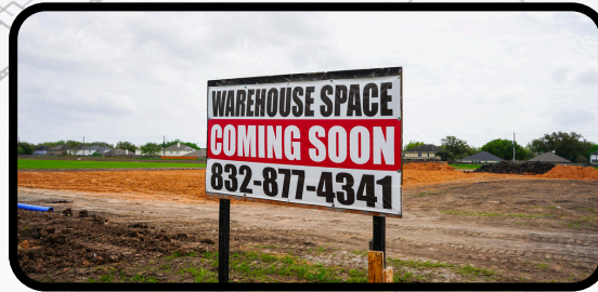
Warehouse Space 4380 Ave I