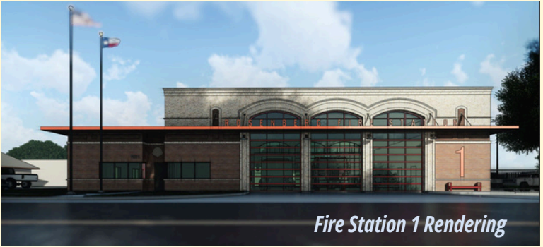
Fire Station 1 Rendering