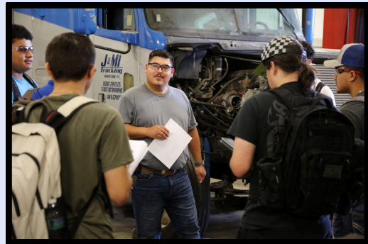
Students discuss repairs on a diesel engine at TSTC's Fort Bend County campus.

The Rosenberg Development Corporation entered into a performance agreement in 2015, reimbursing TSTC a total of $2,500,000 over a ten year period for the construction of the Industrial Technology Building. The facility is operational and houses multiple classrooms servicing a number of industries.