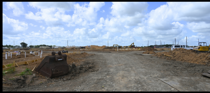
Fairgrounds Apartments | 28325 Retail Lane (By Harbor Freight and EpiCenter)