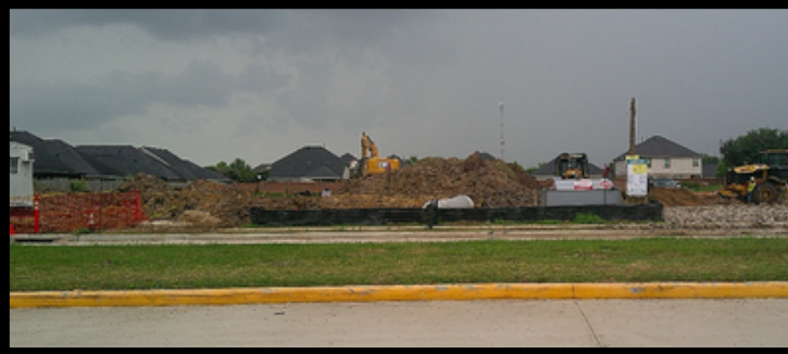
The Learning Experience Day Care Center | 124 Benton Road