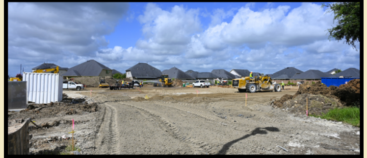
Impax Flex Rosenberg | 26921 Southwest Fwy (office/warehouse complex)