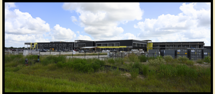
LCISD CTE Center | 1155 Hartledge Road (by Dollar Tree Distribution Center)