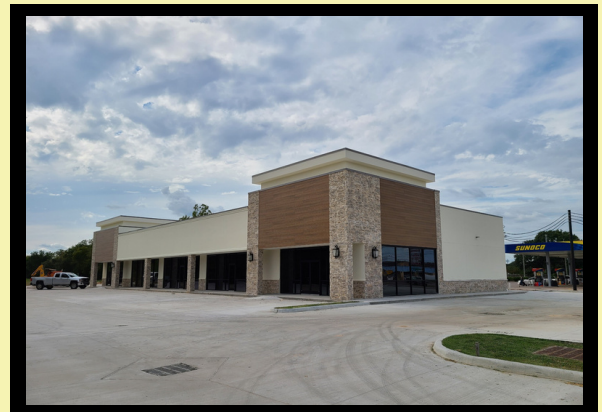
Cortez Office Building (2230 1st Street)