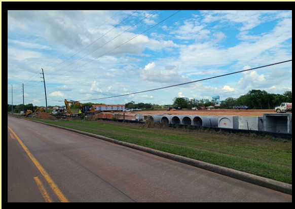
Wet Sounds, Inc. (Louise St. & Mons Ave.)