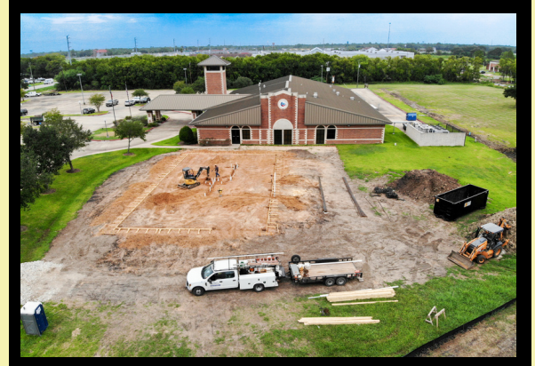
Rosenberg Development Corporation Building (next to Rosenberg Civic Center)