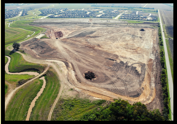
Dry Creek Detention Pond (corner of Ricefield & Benton Roads)