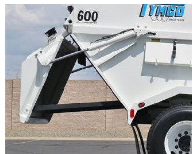
Pick-up brooms load debris into the hopper.