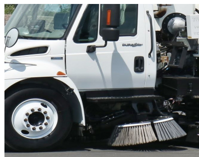
Gutter brooms sweep debris to the middle.