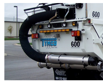
Spraying water holds down the dust.